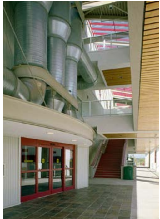
Library Entrance.