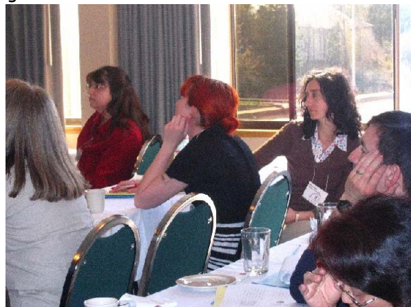
ACRL-WA-sponsored preconference session at WLA conference in Spokane.