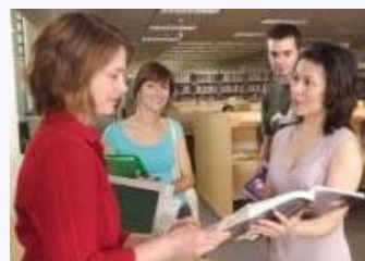
WSU Vancouver is known for service to library patrons

Washington State University began offering courses in Southwest Washington in 1983 as part of the Southwest Washington Joint Center for Education. In 1989, the University formally established Washington State University Vancouver as a branch campus of the state's land-grant institution. The university was then housed in Bauer Hall on the Clark Community College Campus in downtown Vancouver, Washington. The library consisted of one room in Bauer Hall at that time. By necessity the collection was small but drew upon the resources of WSU in Pullman, making WSU Vancouver library a "just in time" provider of information placing it on the cutting edge of what has become a common practice in library service.