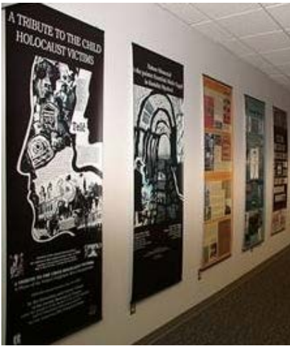
Neighbors who Disappeared

In December 2007, Manuscript Archives and Special Collections (MASC) held the exhibit, Redefining Value: an Exhibit of Five Centuries of Printing . This exhibit was curated by the students and faculty of English 492: From Manuscript to E-Book . In creating the exhibit, students "explored the methods employed in the growing interdisciplinary field of Book History for understanding the creation, marketing, reception, and preservation of texts."