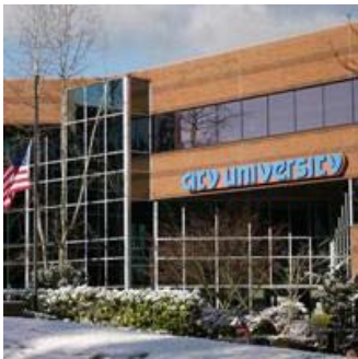
City University of Seattle in Bellevue, WA

CityU students are served by the online resources that are provided by the Vi Tasler Library, the library that is located at the main CityU campus in Bellevue, WA. Students in Europe are served by branch libraries in Trenčín and Bratislava in Slovakia as well as Pravetz in Bulgaria. In order to have more of a global orientation, this year library staff will be looking to work more closely with our library partners outside the U.S.