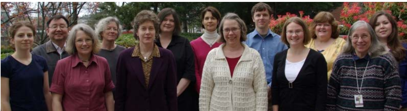
City University of Seattle Library staff