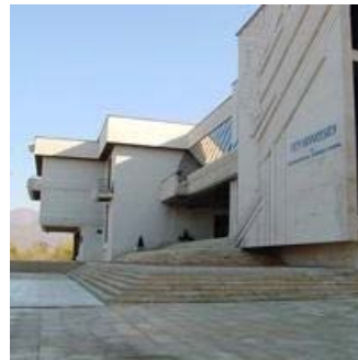
City University of Seattle in Pravetz, Bulgaria