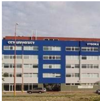
City University of Seattle in Bratislava, Slovakia