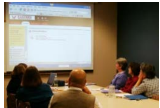
Working with Biology faculty