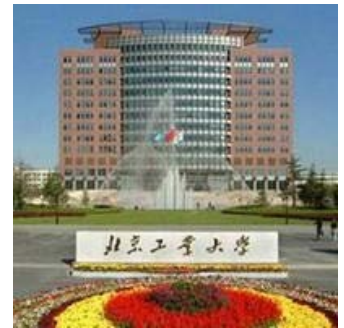
City University of Seattle partner Beijing University of Technology/CIBT School of Business and Technology in Beijing, China